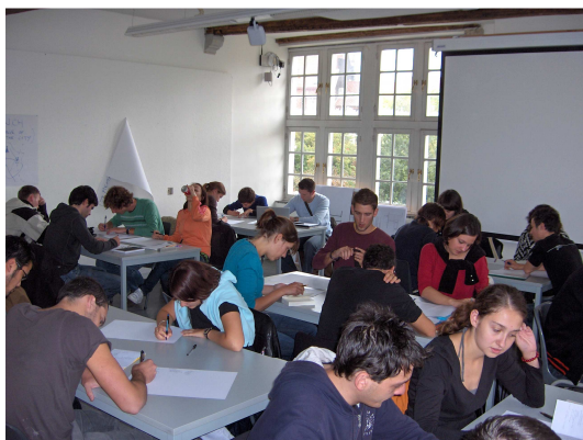
Forty five students and 14 teachers took part in the Ghent workshop

Following the completion of the workshop, the case study and design work was pursued further at each home institutions' design studios which run in parallel throughout the semester. A specific website platform ( www.oikodomos.org/workspaces ) supports learning activities developed by each partner school, exchanges of information between students and teachers, uploading of students' works, evaluation by teachers or groupwork peer-reviews (access to the work stored in this workspace is possible with login: guest; password: guest) . The interweaving of mixed forms of learning and teaching (on-line and off-line, design studios and theory courses) allows the development of a unique curriculum supported by a learning environment adapted to it. The second common workshop will be organised in Grenoble from April 22 nd thru 29 th , 2009. This workshop will be followed by a third one to be held in Bratislava in October 2009.