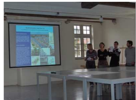
Students presenting their projects at the Ghent Workshop

Such learning environments aim at contributing to the objectives of the European Higher Education Area (EHEA), namely to promote a student-centred model of education.